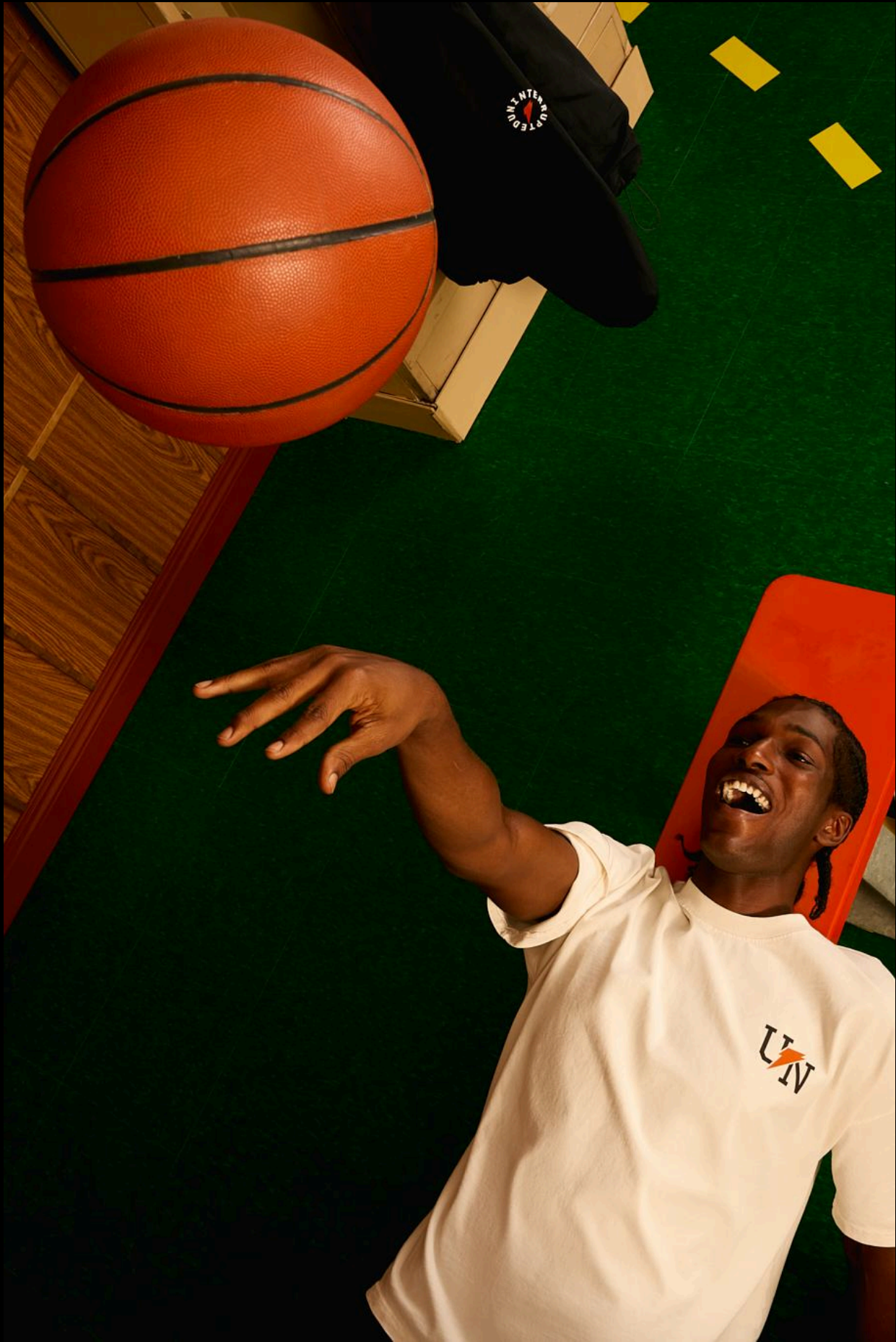
GATORADE X UNINTERRUPTED