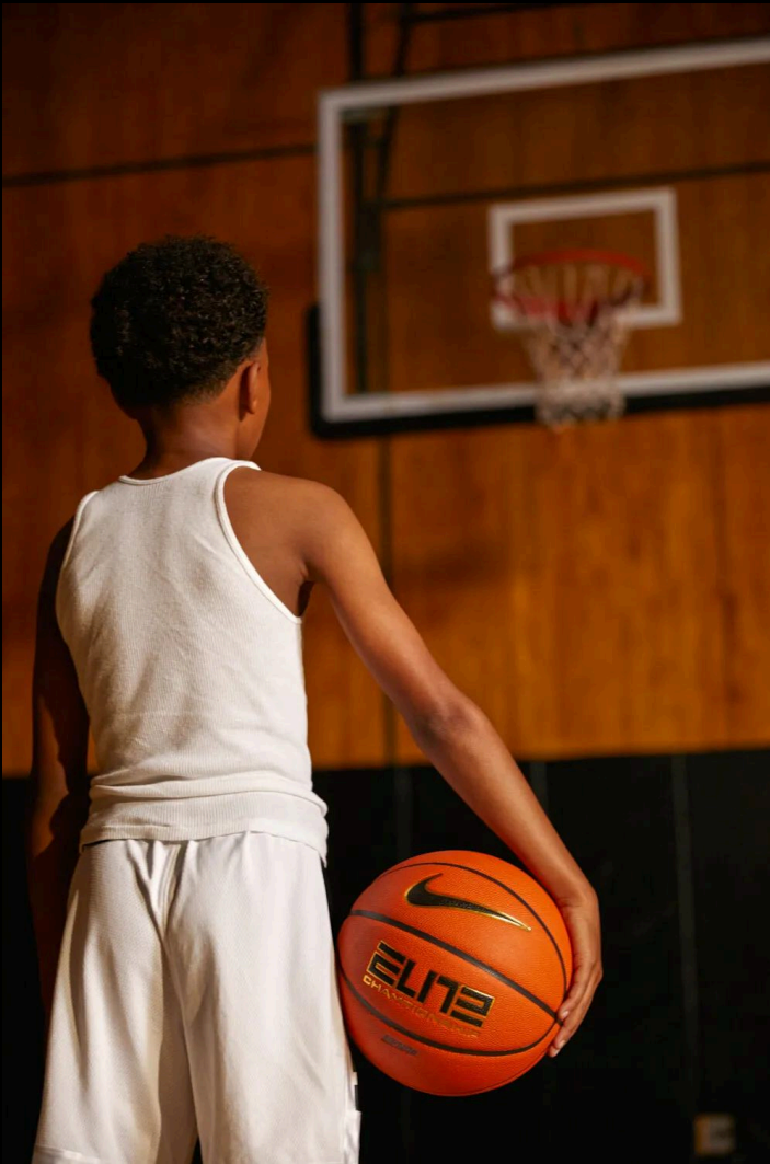
NIKE: Play New '21