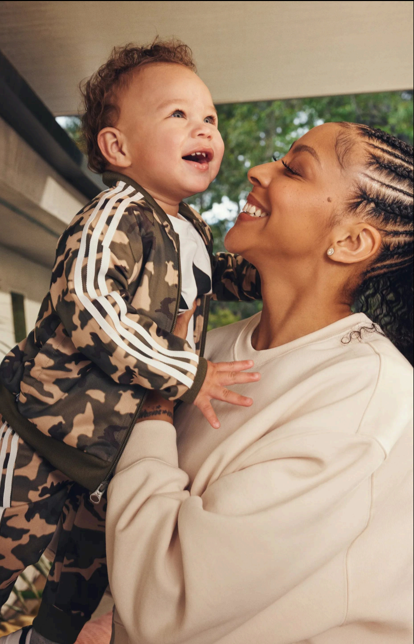
ADIDAS: Candace Parker