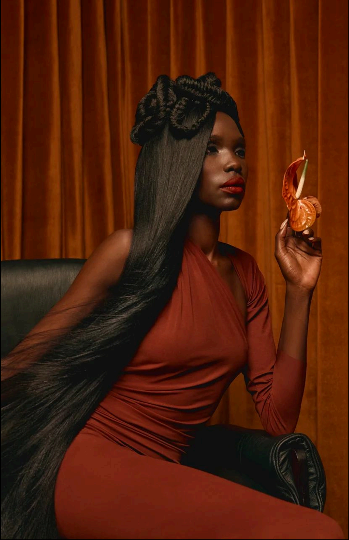
EVE BY BOZ