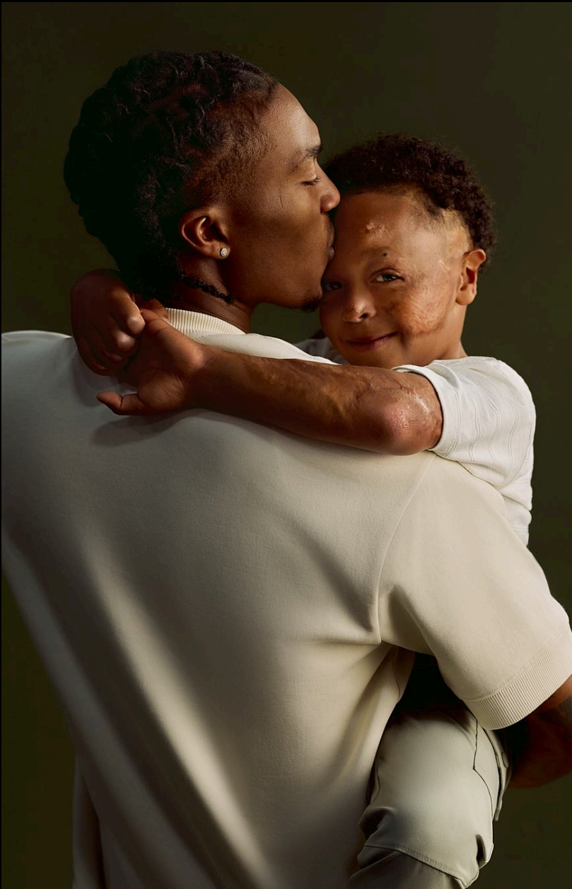
DOVE MEN'S CARE